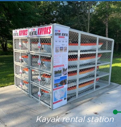
Kayak rental station