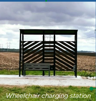
Wheelchair charging station