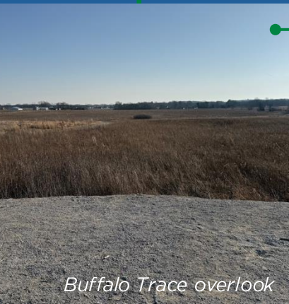
Buffalo Trace overlook