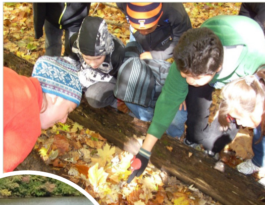
Above: 4th grade students looking for decomposers under a log. Left: Students using binoculars to look at birds.